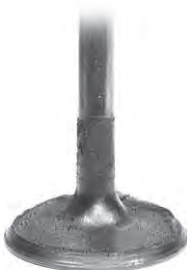
Intake Valve after P.i. Treatment