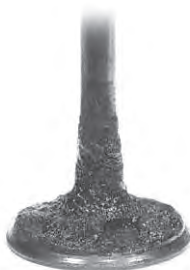
Intake Valve before P.i. Treatment