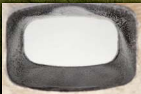
0% Port Blockage