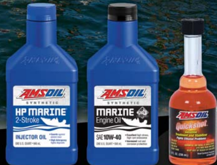
SYNTHETIC 2-STROKE OIL