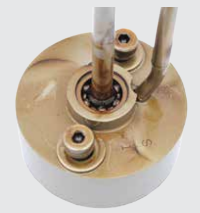
AMSOIL SYNTHETIC MULTI-VISCOSITY HYDRAULIC OIL (ISO 46)