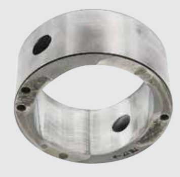
VANE PUMP CAM RING