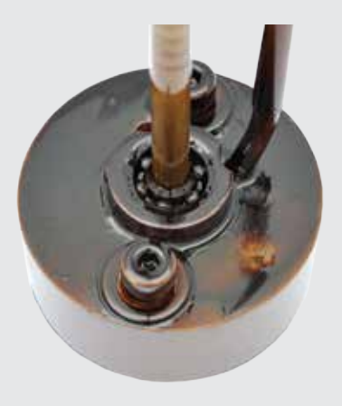
LEADING CONVENTIONAL HYDRAULIC FLUID (ISO 46)