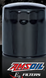
AMSOIL E3 FILTERS