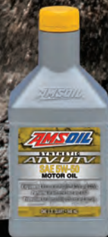
SYNTHETIC MOTOR OIL